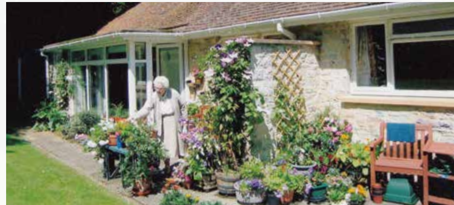
Many of the residents create their own delightful patio displays.